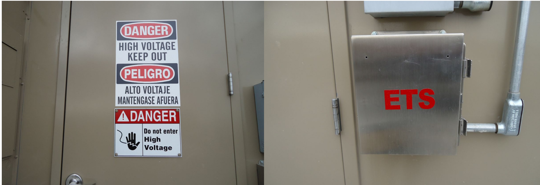
TPSS A-4 side access doors with additional warning signs. Note ETS Emergency Traction Power Shutdown box with reflective “ETS” decal lettering.